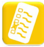
My Elected Officials

My Elected Officials – If the voter info is stored on the phone, this function displays the voter’s current elected officials. If voter information is not stored, the address search is then launched.