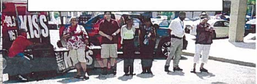
An Ambassador training a community volunteer on how to conduct voter registration drives.