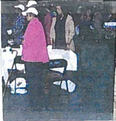
Senior Day at the Arthur Ashe Center